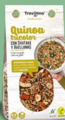
with Shiitake and Hazelnuts