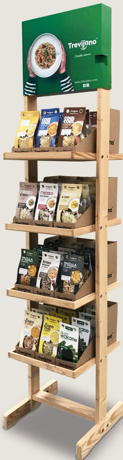
WOODEN DISPLAY 12 CASES (6 units) 41 x 40 x 178 cm