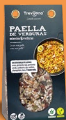
with 6 Vegetables