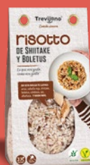
Shiitake & Porcini