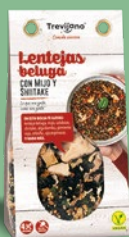
Beluga Lentils with Millet and Shiitake