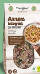
with Green Asparagus