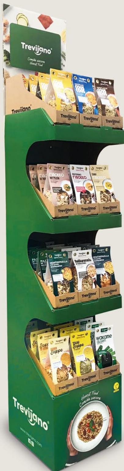
CARTON DISPLAY 12 CASES (6 units) 35 x 36 x 178 cm