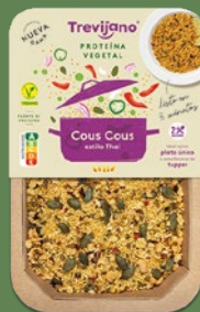
Thai style Couscous