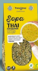
Thai with Quinoa