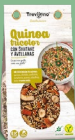
with Shiitake and Hazelnuts