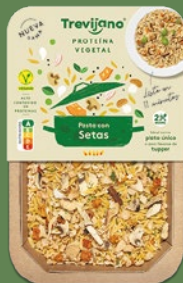
Pasta with Mushrooms