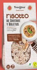
Shiitake & Porcini