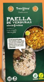
with 8 Vegetables