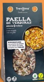
with 6 Vegetables