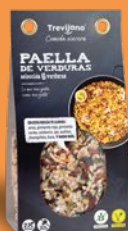
with 6 Vegetables